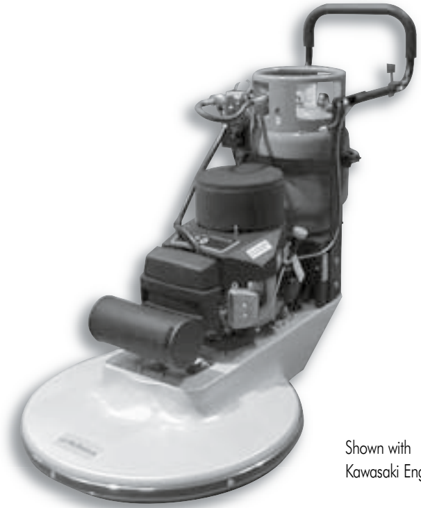
Shown with Kawasaki Engine

NU21PBH-11 - NU21PBH-13 NU21PBK - NU24PBK NU27PBK